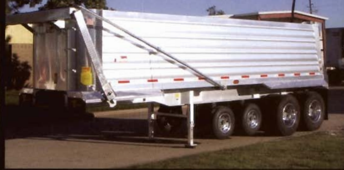
Frame-type with WAVE sidewalls

Travis Body & Trailer, Inc. 13955 FM 529 * Houston, TX 77041 800.535.4372 or 713.466.5888 www.travistrailers.com