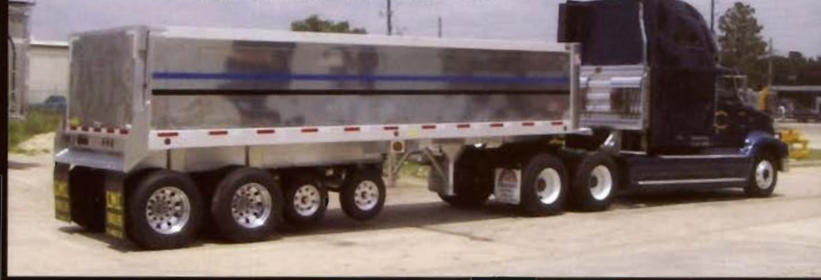
Frameless with AERO-LITE sidewalls